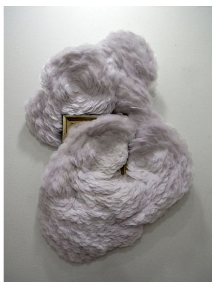
1. Julie Abijanac (United States), Accretion in White , Recycled wood frame, vellum paper and card stock, 60 x 121 x 10 cm, 2019.