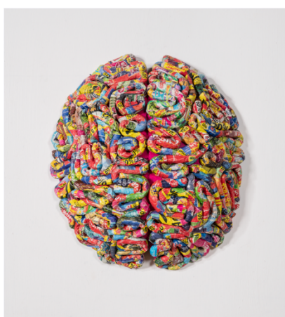
2. Françoise Jaquet (Switzerland) Miroir aux alouettes , cardboard, acrylic paint, glue, newspaper, advertising flyers, 2019.